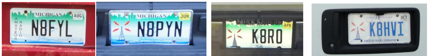
Field Day aficionado vehicles observed at Field Day on Sunday morning