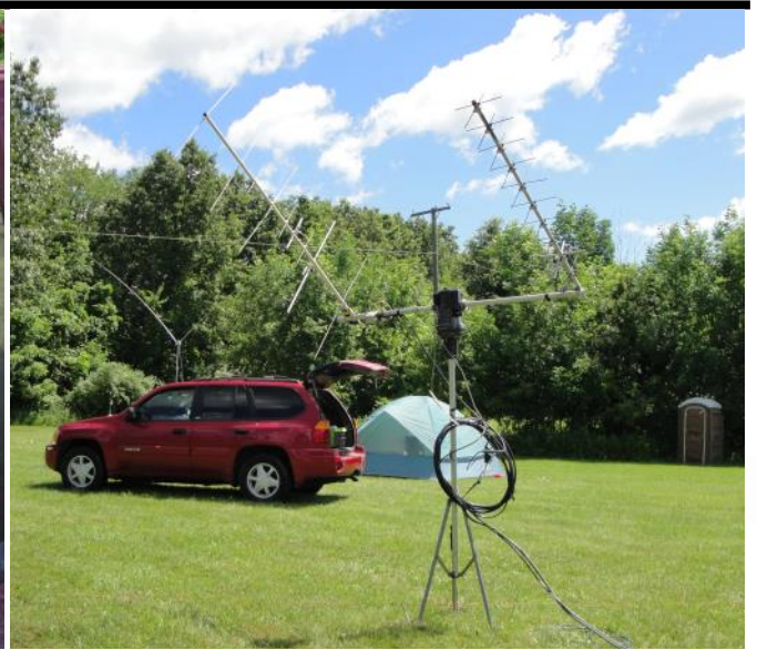
Ted / K8EO and Al / W8All working the FD satellite station with the cross polarized antennas on the right.