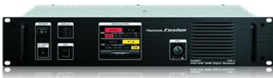
LC Echo 2 Meter Repeater Yaesu DR-1X 147.080 MHz 100 HZ PL

Doug Chauvin, N8PYN 29112 Elmwood St. St Clair Shores, MI 48082 (586) 775-1891 dougn8pyn@ameritech.net