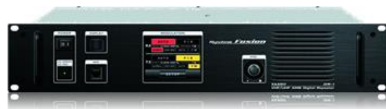
LC Echo 440 Repeater Yaesu DR-1X 442.925 MHz 100 HZ PL